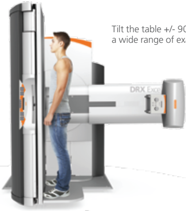
Tilt the table +/- 90° to accommodate a wide range of exams.

The DRX-Excel Plus offers an advanced, remote-controlled table with exceptional flexibility for a wide range of applications. Its ergonomics and efficiency optimize the entire examination process – with convenience for the operator and a low-stress, comfortable experience for the patient.