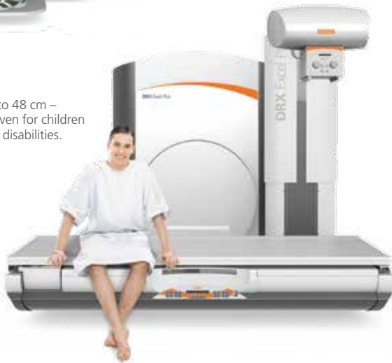
The table lowers to 48 cm – easily accessible even for children and patients with disabilities.