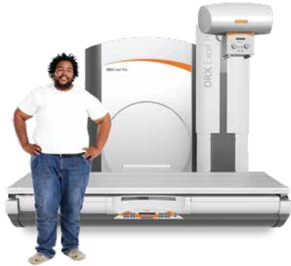
A 265 kg weight capacity means this table accommodates heavier patients.